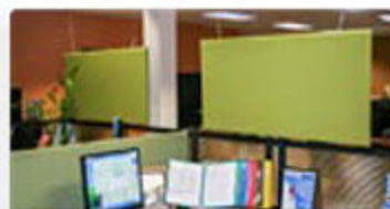
Baffles & Clouds