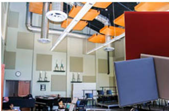
A FEW PANELS CAN IMPROVE ACOUSTICS

Easy To Put-Up • Arrives Ready-To-Hang • Built-To-Last • Useful Anywhere