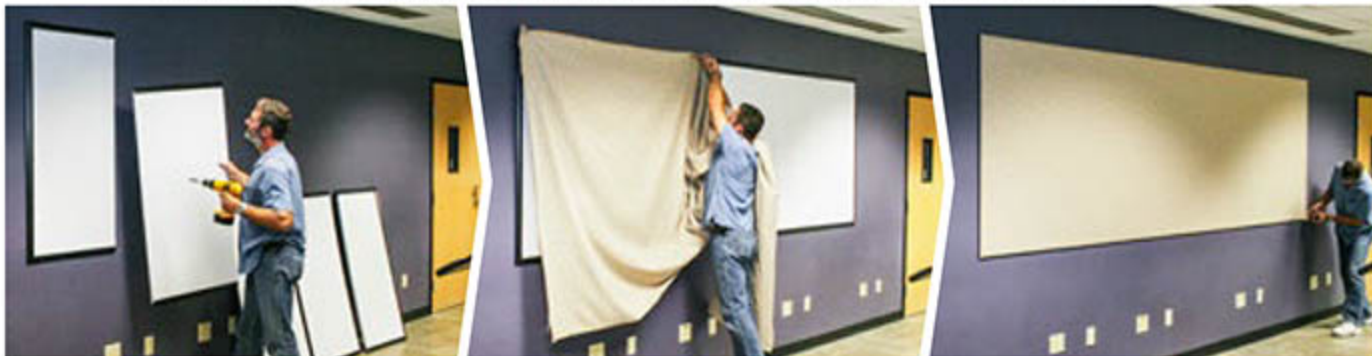
INSTALLATION IS QUICK AND EASY: THIS 4' X 12' PANEL WAS PUT UP IN HALF-AN-HOUR

Each kit includes everything you need to create a large affordable bulletin board panel