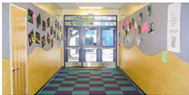
ADORN AND PROTECT THE WALLS IN HIGH-TRAFFIC AREAS

Lifetime Track & ReCore® Warranty FREE Training Available