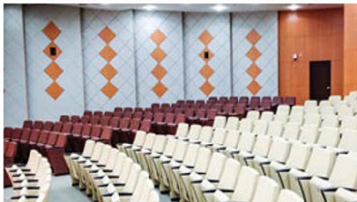
ENHANCE ACOUSTICS & IMPROVE YOUR LEARNING ENVIRONMENTS

Conforms to any architectural feature • Significantly reduces maintenance costs