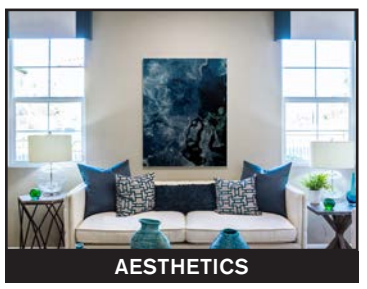
Choose from our selection of Fabrics or use a photo, drawing, or logo to create a custom easy-to-hang Panel.