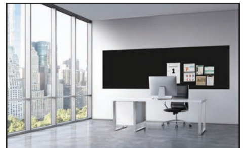
Tackable Modular Panel in Office

ACOUSTIC | TACKABLE | HIGH IMPACT | SUSTAINABLE | THERMAL | FIRE-RATED | NON-ABSORBENT