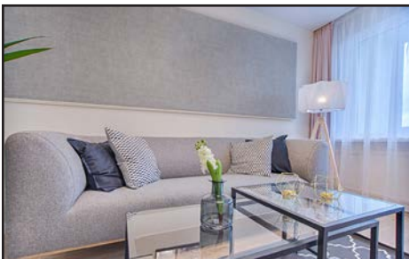
Modular Panel in Living Room

Our Modular (3 Series) Panels are an incredibly easy way to install a long (too large for a shipping box) panel. Modular Panels come with 2 end pieces that are used to essentially book-end a number of middle pieces (all pieces are 2' wide x 4' tall) to create your desired panel size. Use one of our Fabrics, use your own, or Contact Us for Custom Graphic Printing.