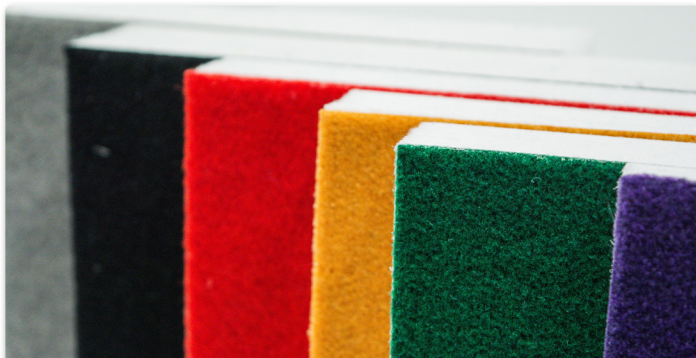
ReCore® is available in a wide range of sizes, densities and color facings to match any specification

ReCore® has no irritating fibers and is free of VOC's including formaldehyde.