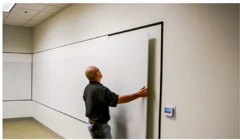
LIGHTWEIGHT & EASY TO HANDLE