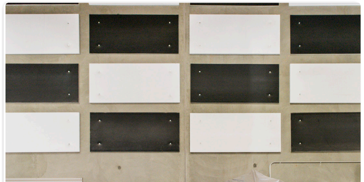
ReCore® can be used in its raw state, as backing, insulation, or as a substrate for Fabric Wall Finishing