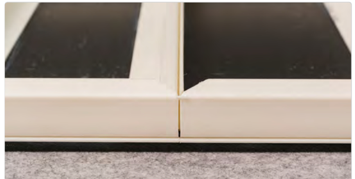
FS160 EDGE & JOINT ON SAMPLE PANEL FS160-NAT (NATURAL) & FS150-NAT (NATURAL) SHOWN