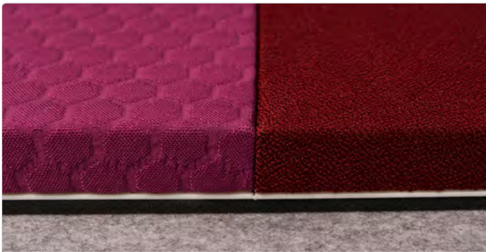
FS160 EDGE & JOINT ON SAMPLE PANEL BEEHAVE & ANCHORAGE FABRIC SHOWN

This Track is perfect for use with our Fabric Wall Finishing System. Combined with our ReCore® Backing and Fabric, this track can be used to create anything from full-wall photographic murals to smaller acoustic or bulletin-board panels as well as Wainscoting and other types of Wall-Protection.