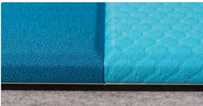
FS260 EDGE & FS280 JOINT ON SAMPLE PANEL ANCHORAGE & BEEHAVE FABRIC SHOWN

This Track is perfect for use with our Fabric Wall Finishing System. Combined with our ReCore® Backing and Fabric, this track can be used to create anything from full-wall photographic murals to smaller acoustic or bulletin-board panels as well as Wainscoting and other types of Wall-Protection.