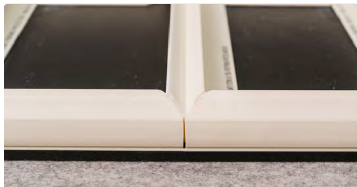
FS260 EDGE & FS280 JOINT ON SAMPLE PANEL FS260-NAT (NATURAL) & FS280-NAT (NATURAL) SHOWN